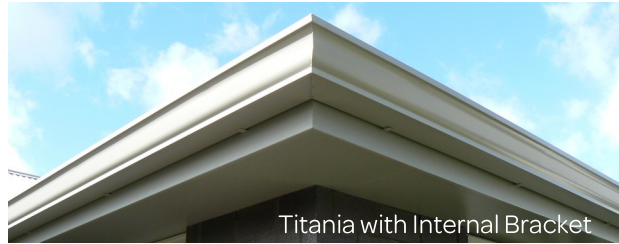
Titania with Internal Bracket