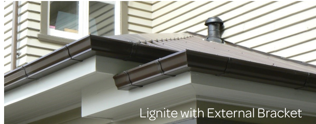
Lignite with External Bracket